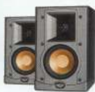
Klipsch RB-10 £230 Page 50