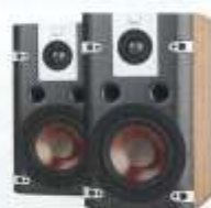
Dali Lektor 1 £250 Page 50