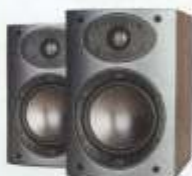
Mordaunt-Short Aviano 1 £250 Page 52