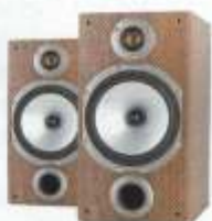
Monitor Audio Bronze BR2 £230 Page 51