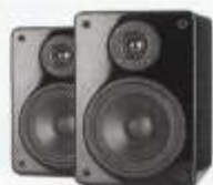
MJ Acoustics Xeno XM1 £230 Page 51