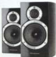
Wharfedale Diamond 10.1 £200 Page 52